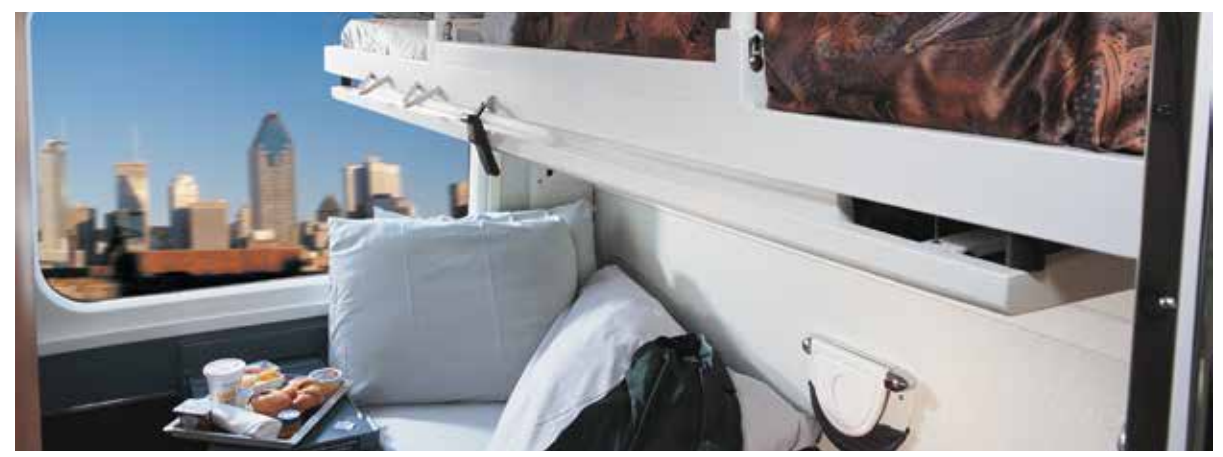
Train travelers gain 500 miles per day by eating and sleeping while the train continues to move.

such breaks. Fatigue, stress, monotony and other factors, however, begin to compromise their ability to operate their vehicle safely, endangering not only themselves and any passengers in their vehicles but also others on the road. The longer the trip, the greater the danger of driving straight through becomes. People on a train, however, move safely while they eat and sleep. They can cover an additional 500 miles or more per day without stress, discomfort or danger to others.