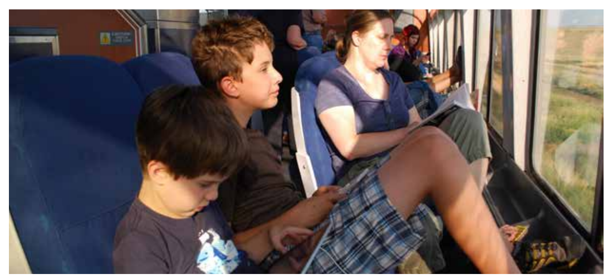
Trains can offer more varied and comfortable accommodations because they are so fuel efficient.

Long distance trains are cost efficient—a finding that may surprise many. Despite years of neglect, underinvestment and retrenchment, Amtrak's cost to move one passenger one mile (the accepted industry measure of efficiency) is roughly the same for both long-distance and in-state routes on corridors outside the Northeast. This parity is not obvious in Amtrak's financial reports because these reports include state—but not federal—payments for service as revenue.